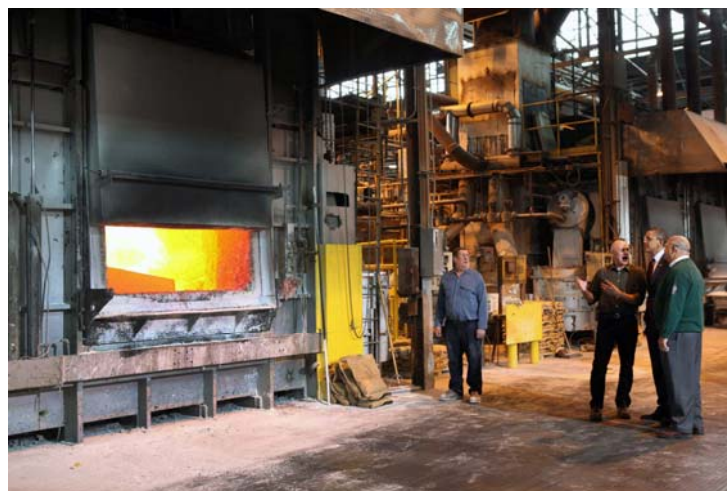
President Barack Obama tours Skana Aluminum Company, an aluminum manufacturer and rolling mill in Manitowoc, Wis., Jan. 26, 2011.

Orion and Skana Aluminum are manufacturing companies. The companies are great examples that demonstrate the benefits of the B&I Guaranteed Loan program. They have established and maintained credit relationships with local community banks, Hometown Bank and Community Bank & Trust, respectively, on the performance and growth of their businesses. Through their bank relationships they accessed the B&I Guaranteed Loan program