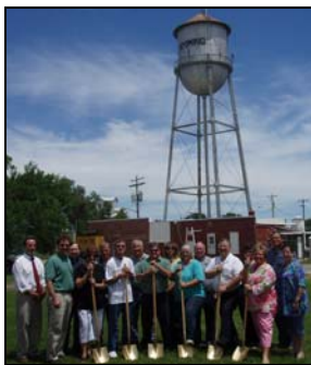
The City of Wyoming broke ground on its $5.5 million water system improvements on June 25, 2009.

In the City of Wyoming, the days of low water pressure for residents and inadequate pressure and flow for fire protection will soon be over. The city broke ground Friday to replace virtually its entire water distribution system.