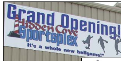
Hidden Cove Sportsplex in Bourbonnais celebrated its grand opening on June 25, 2009. Pictured to the right is part of the sportsplex's miniature golf course.

Businesses in communities with up to 50,000 people may be eligible for guarantees of up to 80 percent. Area businesses can utilize this program for acquisitions, construction, conversion, expansion, repair, modernization and for development costs. They can purchase equipment, machinery and supplies and use the funds for start-up costs, working capital and certain types of debt refinancing. ▪