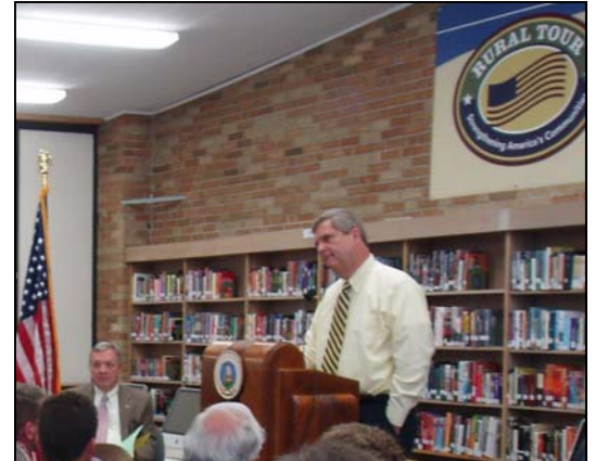
Agriculture Secretary Tom Vilsack and U.S. Senator Dick Durbin (seated at left) listen to questions and comments from community members in Geneseo on June 1, 2009.

Vilsack's visit to Illinois in June continued the USDA's listening tour through rural America. Previously, he visited Brush, Co., Portageville, Mo., Ludowici, Ga., and Harrodsburg, Ky. After Illinois, he visited with communities in Indiana.