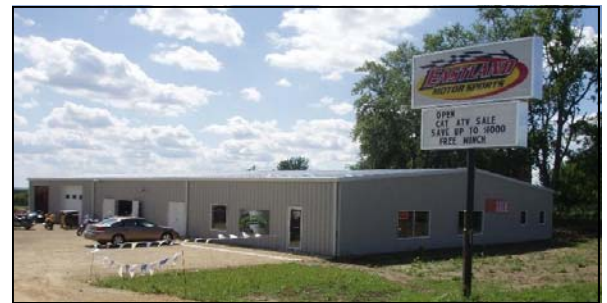
Eastland Motor Sports' new 10,000 square foot building in Lanark, IL.

Loan guarantees provide lenders with another tool to expand their loan portfolio, increase earnings through participation in the secondary market and allows them to make loans above their legal lending limits. The lenders can then, in turn, offer businesses higher loan amounts, lower interest rates and longer repayment terms. Businesses in areas with up to 50,000 people may be eligible for guarantees of up to 80 percent. Area businesses can