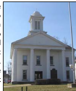
Pictured is the Stark County Courthouse in Toulon, IL. Stark County received a $160,000 direct loan and a $50,000 grant to install an elevator to make the courtroom accessible.

Community Programs can make and guarantee loans to develop essential community facilities in rural areas and towns of up to 20,000 in population. Loans and guarantees are available to public entities such as municipalities, counties, and special purpose districts, as well as to non-profit corporations.