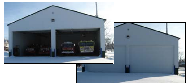
Pictured above is the Dana Fire Protection District (FPD) facility in La Salle County. Dana FPD received a $105,000 loan and $24,194 grant to expand and build an addition to their fire house.

For more information on this program, contact your area Illinois Rural Development office: http://www.rurdev.usda.gov/il/ao-list.htm . ■