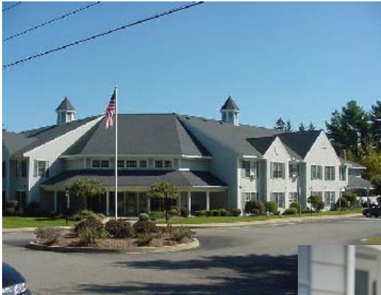
Marconi Village, Marion, MA

Eligibility for these loans, loan guarantees, and grants is based on family income and varies according to the average median income for each community. Financing is also available for the construction of multi-family complexes in rural communities that lack sufficient, affordable rental housing, and provides subsidies serving low-income individuals, the elderly and people with disabilities.