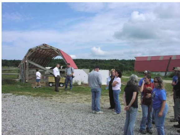
Carter & Stevens Farm