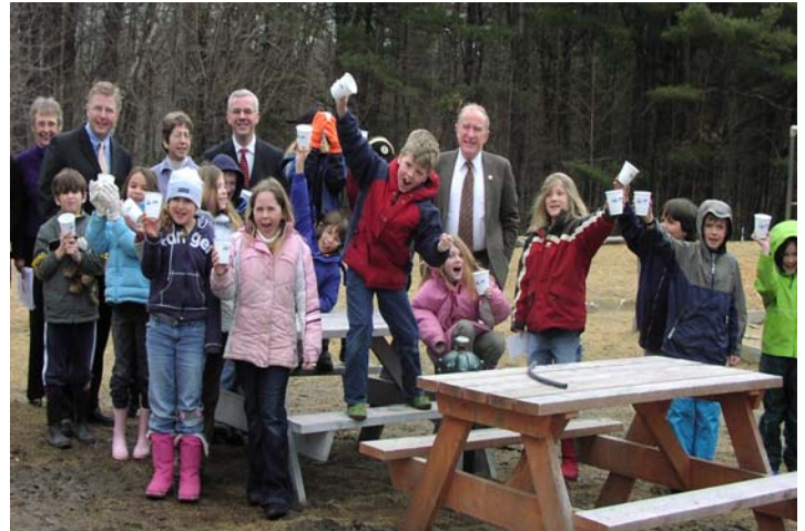
The Village School, Royalston, MA

In Fiscal Year 2008, USDA Rural Development in Southern New England delivered over $16.4 million in funds through the Community Facilities Program.