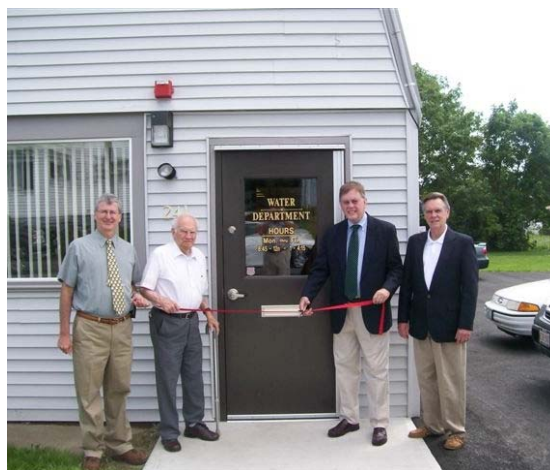
North Tiverton, RI