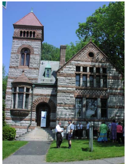
Warren (MA) Library

Essential community infrastructure is key to ensuring that rural areas enjoy the same basic quality of life services enjoyed by those in urban areas. The Community Facility Program offers grants, direct loans, and loan guarantees to develop or improve essential community services and facilities in rural areas.