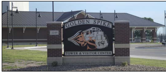
L-R: BAILEY YARD WELCOME SIGN BEFORE AND TODAY'S GOLDEN SPIKE TOWER & VISITOR CENTER SIGN.