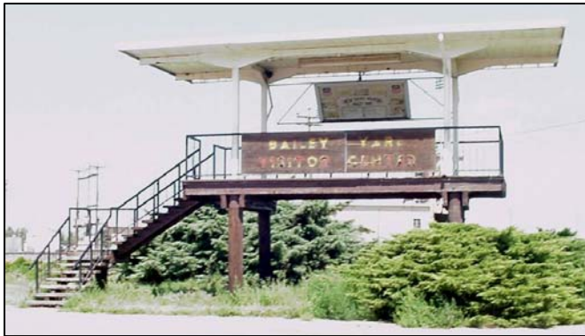
L-R: BAILEY YARD OLD VISITOR CENTER AND THE GOLDEN SPIKE TOWER & VISITOR CENTER.