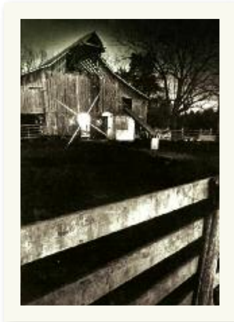
The formation of utility cooperatives greatly increased the rate at which electricity service was extended to farms, such as this, and rural communities.

FCA was moved to USDA in 1939. Research and technical assistance were transferred to a separate USDA agency, the Farmer Cooperative Service, when FCA became a lending system independent of the federal government in 1953. After many reorganizations over several decades, the Clinton/Gore "reinvention of government" in 1994 resulted in moving responsibility for