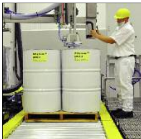
Barrels of anhydrous milkfat are prepared for shipment at a California Dairies Inc. (CDI) processing plant.

AMF is 99.8 percent pure butter oil. Packaged for commercial use as a food ingredient, AMF has an extended shelf life and is an excellent form for storage and transportation of butterfat. CDI, headquartered in Visalia, Calif., is the second largest dairy processing