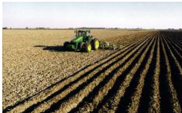
Farm supply cooperatives are increasingly helping their members adopt precision agriculture practices.

Data ownership is one of the hottest topics in precision agriculture. The crop producer is not only the primary collection agent for the data generated by his farm equipment, but also the owner of that data. Most growers today rely on their local co-ops to interpret the data and formulate a crop