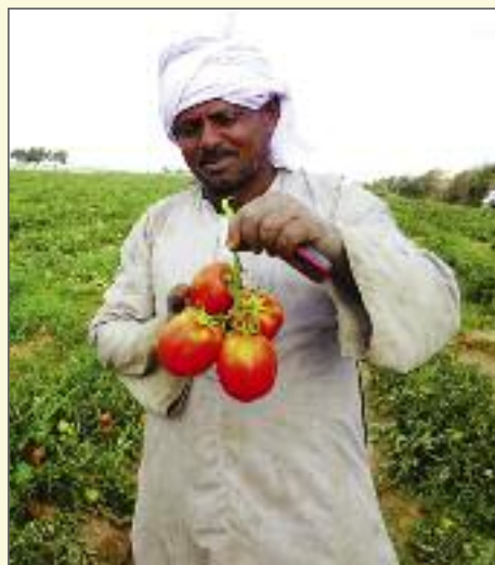
After meeting contractual obligations to processors, growers can sell the rest of their crop in local markets.

The total net return per feddan of tomatoes increased from $170 in 2007 to more than $3,000 during the winter 2011/2012 season. The return was