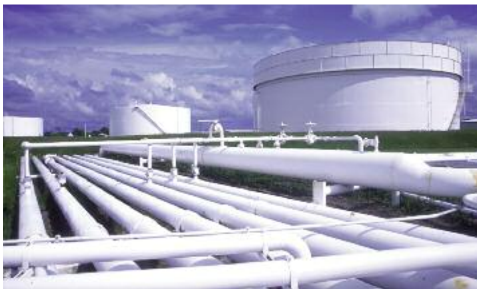
Energy sales helped boost income for CHS Inc. during an otherwise "challenging year."