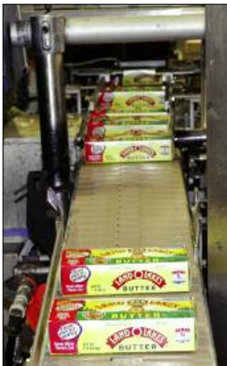
The Dairy Foods division of Land O'Lakes enjoyed a 101-percent jump in pretax earnings in 2013.