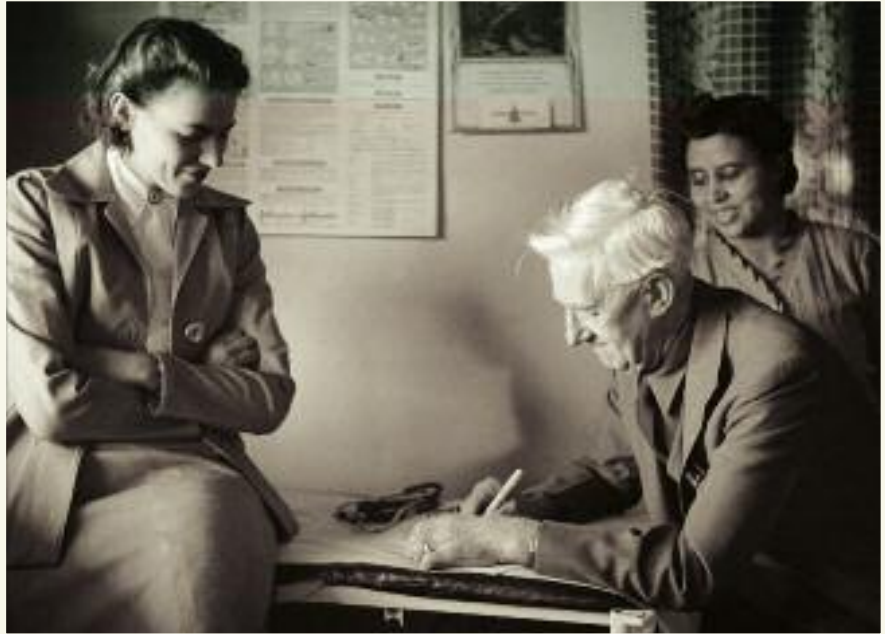
A doctor writes a prescription in the clinic operated by the Taos County Cooperative Health Association in Questa, N.M., in January, 1943.

Rural Electric Cooperative Association (NRECA) in 1942 to accomplish shared services and to secure congressional reauthorization of REA in 1944. As with FCA and other independent New Deal agencies, REA was moved to USDA in 1939. It was renamed the Rural Utility Service in 1994 and became a part of USDA's Rural