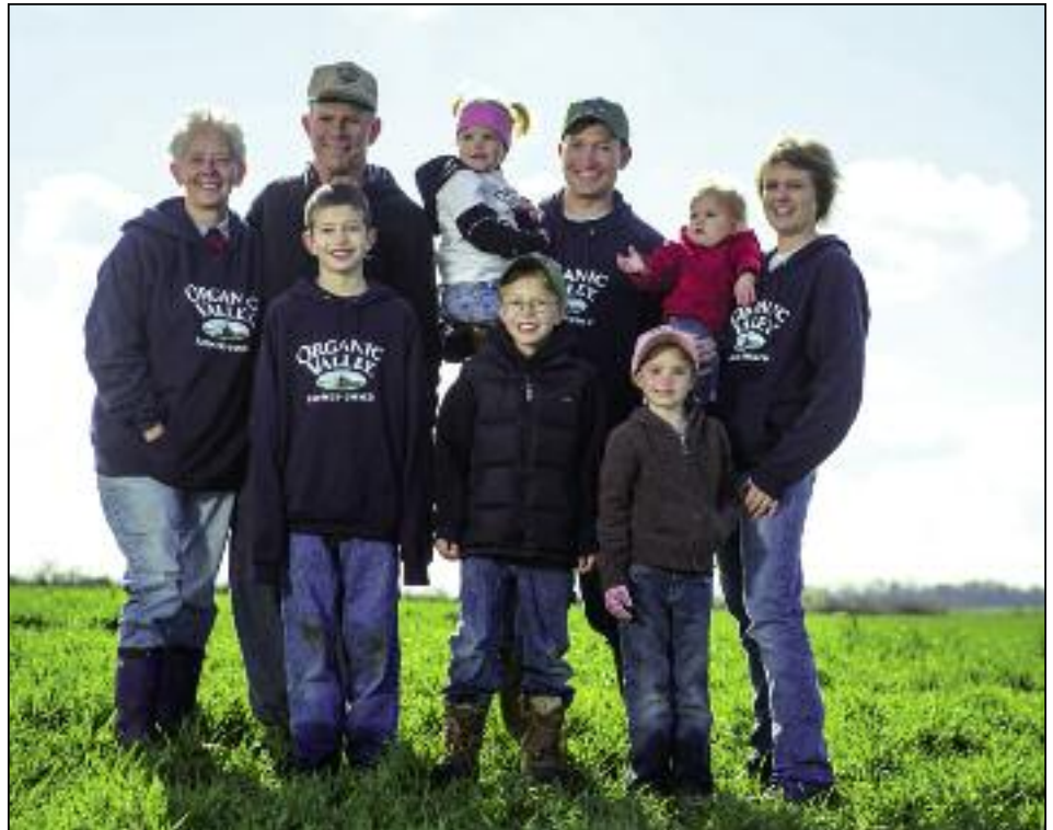
Organic Valley members saw their co-op's sales climb 8 percent in 2013, aided by resourceful employees who kept the business rolling despite a fire that destroyed much of its headquarters.

Even a fire that burned down half of its headquarters in La Farge, Wis., last