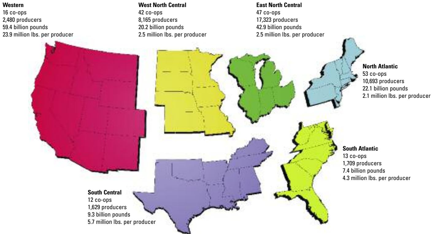
Figure 1—Number of Cooperatives Operating in Each Region, Member-Producers, Member Milk, and Milk per Producer, 2012

Editor's note: This article includes highlights from a forthcoming report, "Marketing Operations of Dairy Cooperatives, 2012," USDA Cooperative Programs Research Report 230. The full report will be posted later this spring on the USDA website at: http://www.rurdev.usda.gov/BCP_Coop_LibraryOfPubs.htm .