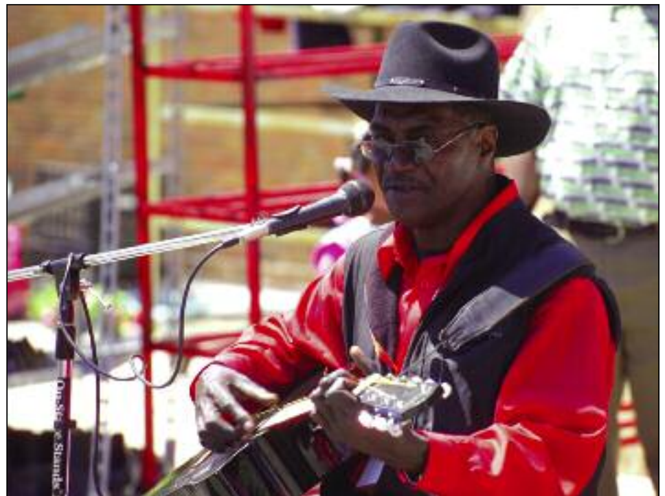
Eastern Market is not only a great place to buy home-grown foods and ornamentals, but also to be entertained by down-home Michigan musicians.