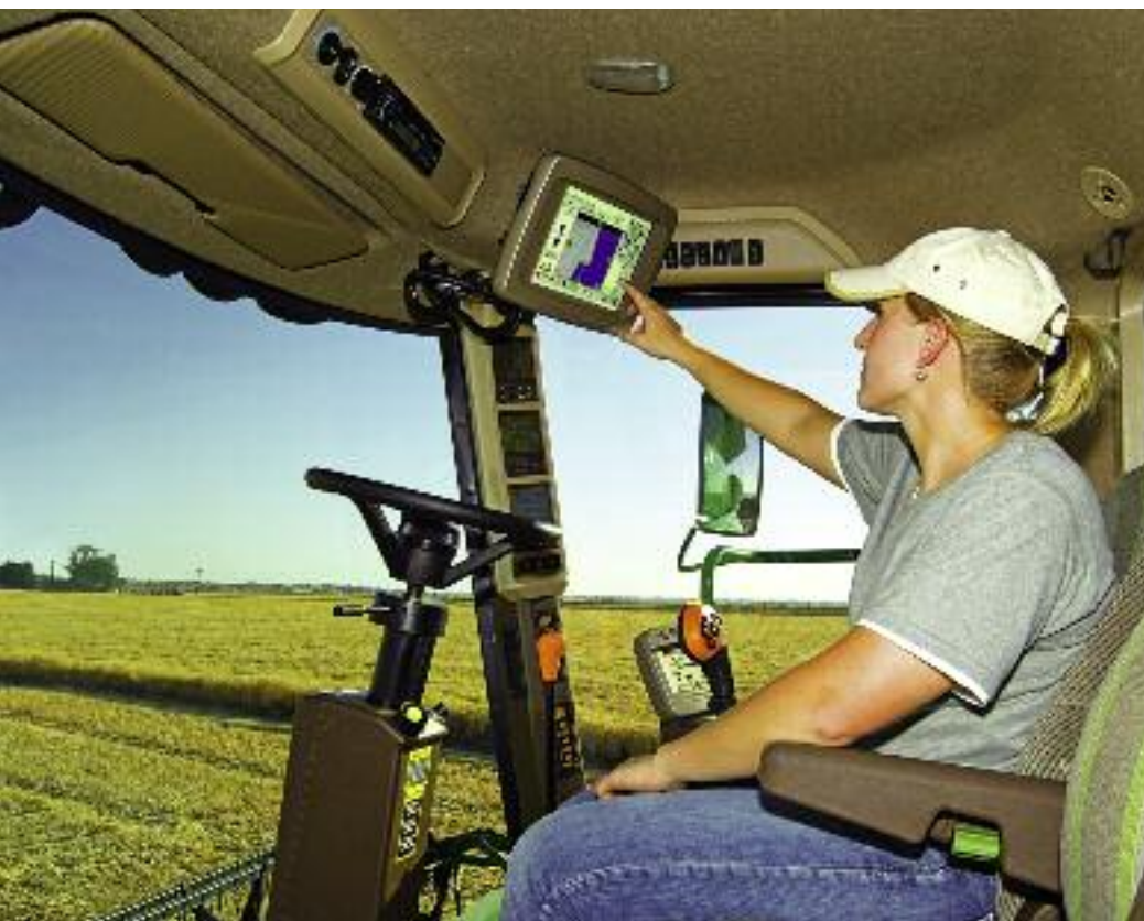
Using global positioning system (GPS) technology (above) helps farmers fine-tune their application strategy for seeds and fertilizer. Precision ag technology helps farmers improve crop yields while lowering their production costs and often reducing environmental impact.